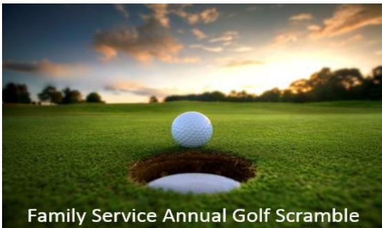
Family Service Annual Golf Scramble

The annual Golf Scramble and Luncheon offers a special opportunity for corporate partners and individuals to assist Family Service programs and get together over a meal and links! The 2019 event: May 16, 2019 at Otter Creek Country Club.